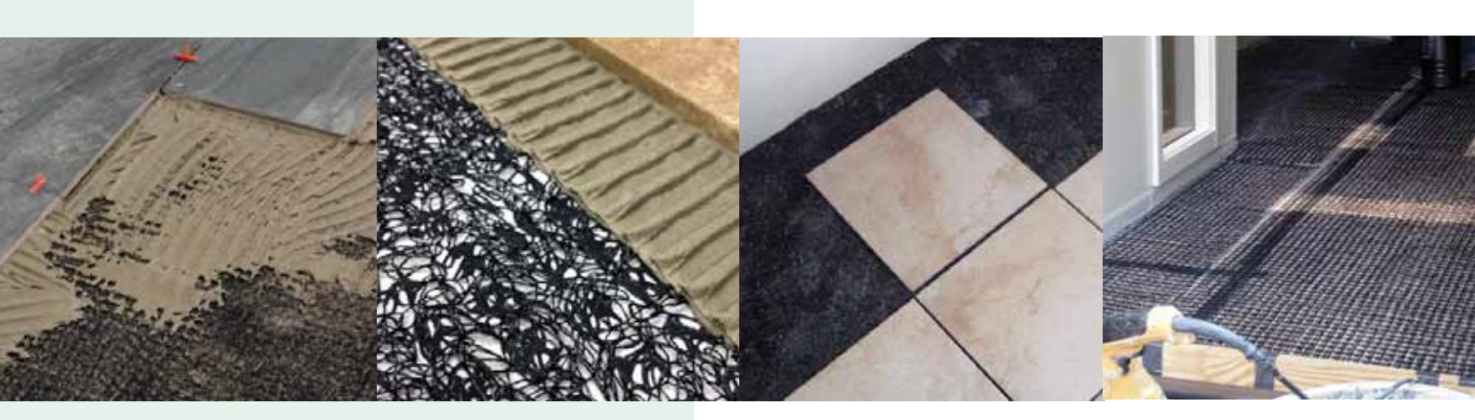
Flooring Experts since 1951

a triple layer waterproofing band designed for KeedeRoll 300™ waterproofing installations.